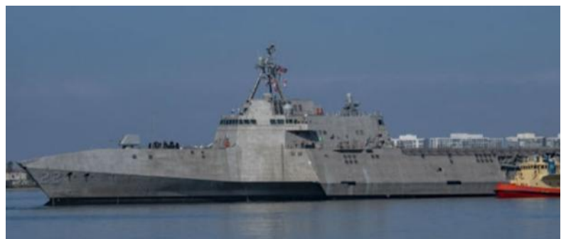
USS Kansas City prepares to dock at Naval Base San Diego.